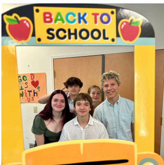
Back to School Blessing