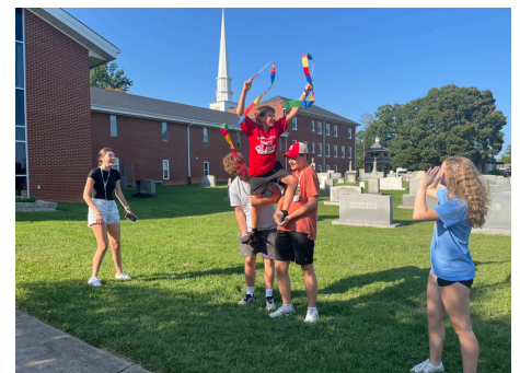
Fall Youth Kickoff