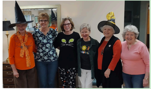
Vienna Village Singers