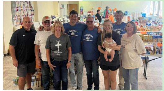
Delivering Supplies in Canton