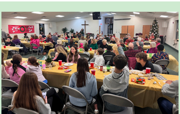
Church Christmas Party