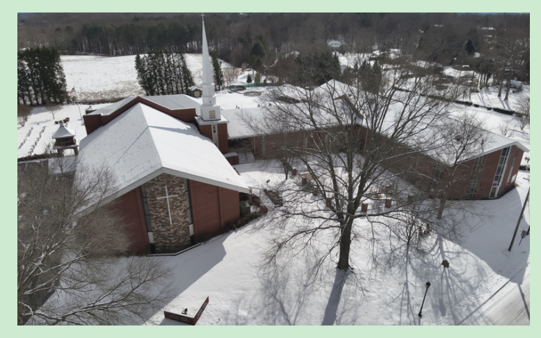
LUMC in the Snow