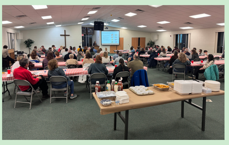
Learning about Anxiety